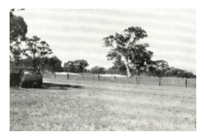
Fig. 32.-An attractive roadside scone in the Apsley unit where solonetzic soils are used extensively for improved pastures. The erosion hazard is insignificant.

Glenelg Valley slopes and tableland, settled