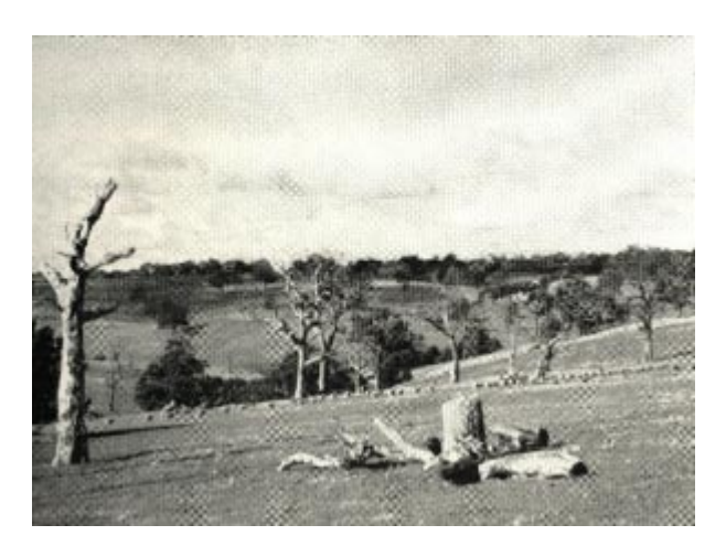
Fig. 38.-A view of dissected tableland typical of the Glenelg unit, showing the tableland on the skyline and valley slopes susceptible to soil erosion.

A detailed examination of both units would be useful in assessing the proportions of flat heath lands, less costly for clearing and occasionally moister than areas of stringybark. Investigations such as those in the Coonalpyn Downs of South Australia, involving both the mapping of different soils and establishment of pasture trials, should be undertaken in these units in the future. Some pasture experiments on infertile sandy soils have been undertaken outside the Shire by the Victorian Department of Agriculture, namely in the Miga Lake district and in the Little Desert at points south of Kaniva and Nhill. These have shown various mineral deficiencies and similar findings probably apply in the Little Desert and Kowree units.