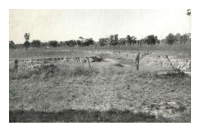
Fig 36 - An erosion gully in the White Lake unit

The White Lake unit is mainly open pastoral land where cereal-growing formerly was more extensive. The steep slopes show sheet erosion and there are, occasional moderately deep gullies on gentler slopes (Fig. 36). Salt damage occurs mainly around the salt lakes, but also in association with drainage lines and gully erosion. Further extension of cereal-growing would need precautions such as wide rotations, improved pastures, and possibly soil conservation works to check erosion. Salt damage on lower areas may be increased by further clearing of scrub from higher areas.