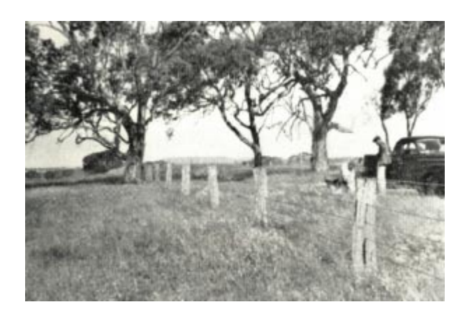
Fig 34 – The creast of one of the distinctive ridges in the Goroke unit, north-west of Duffholme, looking towards Mt Arapiles. The site has a sandy solodic profile (Profile 7, Appendix I) with a yellow gum (Eucalyptus leucoxylon).

Ready drainage from the ridges (Fig. 34) into numerous swamps gives this unit an even more arid environment than is expected by comparison of its rainfall with that of units to the south. Erosion is noticeable-sheet erosion on sandy banks, frequent shallow gullies on ridge-slopes, and wind erosion occasionally on sandy patches near ridge tops. Some of the wind erosion is associated with former aboriginal camps (Fig. 35) and is probably older than European settlement; fortunately it is not extensive. Prolonged cultivation and intensive grazing have induced soil compaction and consequently sheet and gully erosion; this would be intensified on the steeper slopes if large-scale reversion to cereal-growing takes place without safe rotations and possibly soil conservation works such as graded banks.