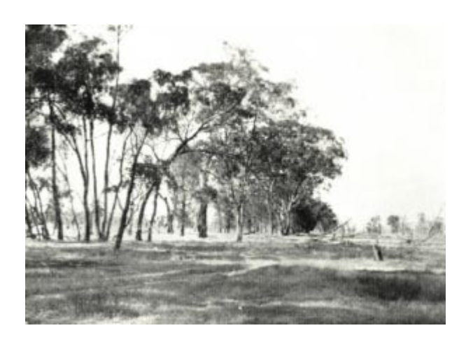
Fig. 33.-A remnant of grey box (Eucalyptus hemiphloia) and bull oak (Casuarina luehmanni) vegetation along a fence line in the Toolondo district. Tree removal has aided growth of natural grasses, but occurrence of crabholes hinders pasture improvement.

Control of water movement is obviously important in these units. Some extension of artificial drainage may be needed but the chief requirement is productive pastures to use surplus water and improve soil permeability. Field experiments valuable for pasture improvement in these units have been conducted at Kybybolite and Apsley but variations in potassium and calcium contents of the solonetzic solodic soils indicate the need for fertilizer trials in varying soils. There is particular need for trials on the establishment and management of improved pastures, with special regard to fertilizer requirements and crop rotations. Seasonal flooding of swamps and other low parts restricts production on significant areas but as these become dry there are favourable conditions for productive growth if plant species can be provided to utilize this short growing season. Investigations for these should also aim at the development of rotations to allow periodical growth of crops after soil improvement by productive pastures.