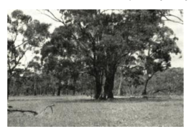
Fig 37 – One of the smaller areas of native grassland with yellow gum (Eucalyptus leucoxylon) and yellow box (E. melliodora) in the Kowree unit near Lake Kanagulk (Profile 26, Appendix I)

less. The Kowree unit occurs as strips of virgin land adjacent to successful pastoral holdings and it is almost inevitable that landholders will seek to increase production by progressive use of this unit. The Little Desert, however, forms a large block and its extensive use would entail the formation of new holdings entirely dependent on productivity from infertile soils. Thus although the soils in both units are infertile and relatively arid, involving considerable expense in clearing and subsequent pasture maintenance, the Kowree unit has many advantages compared with the Little Desert.