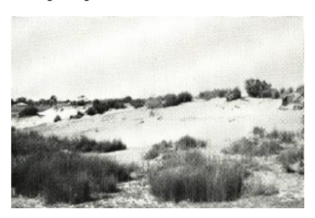
Fig. 35.-Wind erosion on aboriginal carnp sites occurs in several places in the Goroke unit.

Pasture improvement is confined to a few properties which show the merits of subterranean clover, phalaris, and lucerne on solonetzic or solodic soils, and of perennial veldt grass on deeper sands. Natural grasses provide the main herbage on the large holdings, while Wimmera ryegrass is more important on the smaller farms where some cultivation is still customary. Experimental trials, demonstration plots, and pasture competitions in this unit would contribute much to pasture improvement and soil conservation. Topical subjects for investigation include pasture improvement for solonetzic and gilgaied solonetzic soils on gentle slopes, and the alternation of productive pastures with cereal-growing.