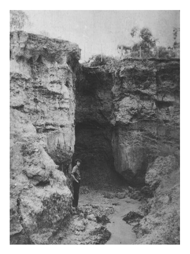
Plate 3. The waterfall in this deep gully has caused only a little erosion In 4 years. The slat was eroded by spalling and slaking.