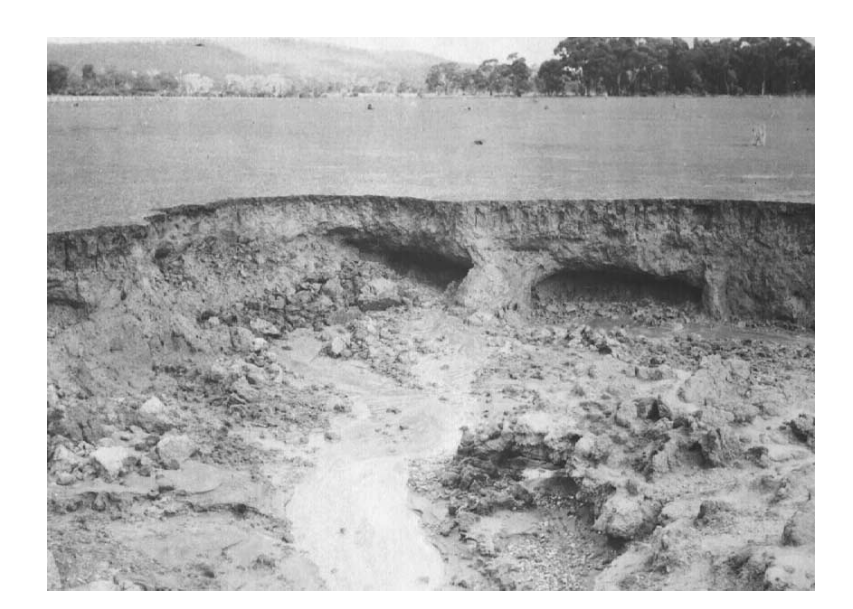
Plate 8. Basal extrusion sapping. Erosion is proceeding without surface runoff