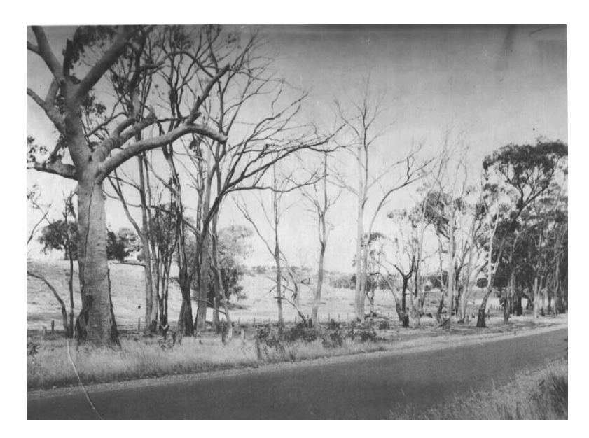
Plate 1. Trees killed by saline seepage at the foot of a hill