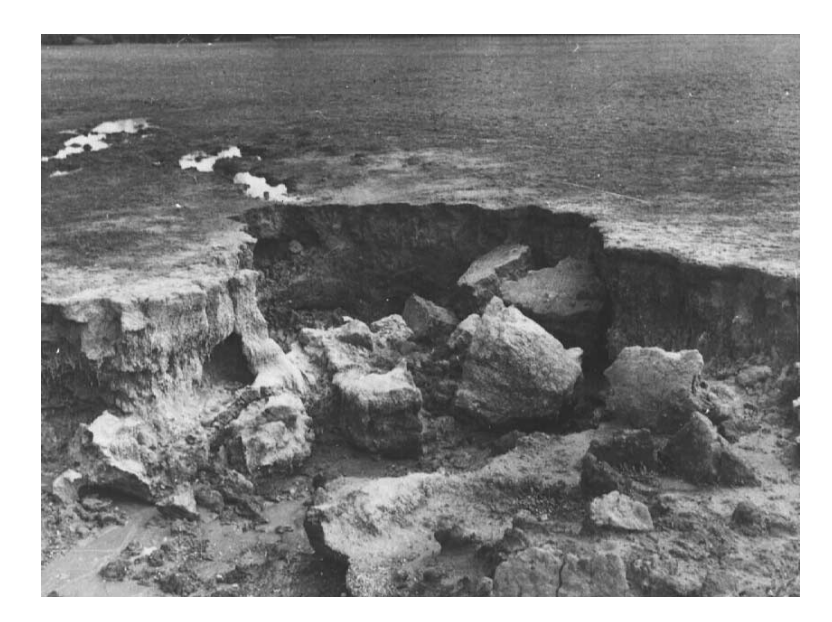
Plate 4. Undercutting of a head by diversion of the waterfall