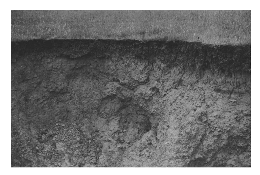
Plate 5. A gully head operating by spalling