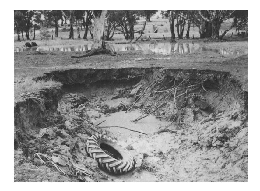
Plate 7. Undermining of a hea by waterline earthflows after a flood