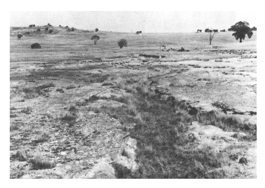
Plate 2. Scour gullies developed from rills on a salt pan