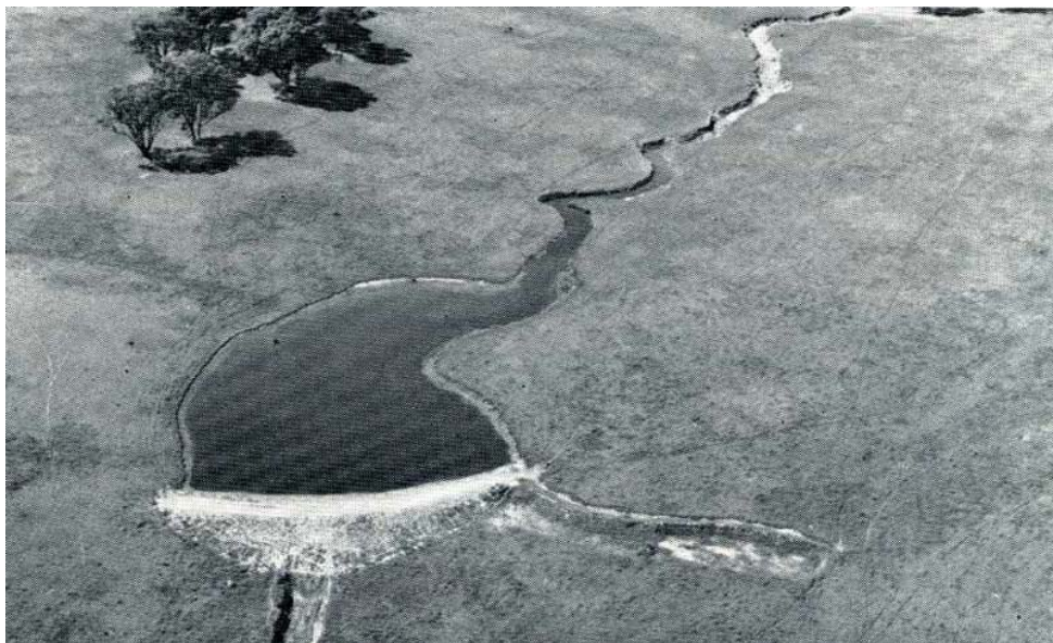
A liability has been turned into an asset by the building of a gully plug dam. Erosion in the surrounding paddock is being minimized as improved pastures become established.