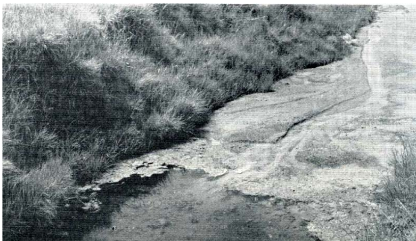
This is typical of the silt that was either directly entering the reservoir, Lake Eppalock, or directly entering main streams to the Lake

The operation of chisel seeding is carried out by the landholders themselves (being reimbursed the cost of the working by the Authority to an amount not exceeding $3 per acre), by contractors engaged by the Authority or by the Authority using its own equipment on special areas. By far the largest area is sown by contractors to the Authority, as many as twelve separate contractors being engaged over the sowing period.