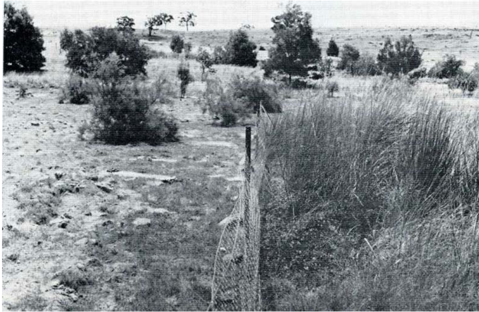
Soil salting follows removal of vegetation in the Catchment. On the right can be seen one of the experimental areas of the Soil Conservation Authority.