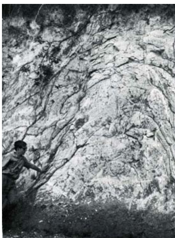
These Ordovician sedimentary rocks are folded and distorted.

Thicker beds of Lower Carboniferous sediments in the south of the study area have been deeply dissected to produce steep mountainous terrain, notably in the headwaters of the King River East Branch. The prominent razorback ridge of The Razor is also formed in these rocks.