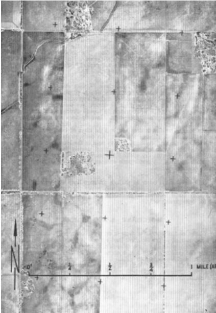
Plate 28 – Aerial photograph of part of the Boigbeat land system. In the Parish of Boigbeat to the south-east of Sea Lake. The hummocks form a pattern which can best be seen in the paddocks to the left of centre. The dark shading represents relatively small areas of plains in low sites between the hummocks.

To the east of Sea Lake there is an area of some 270 square miles which has been mapped as the Boigbeat land system. In this district the landscape is composed of a plain on which there is a dense array of hummocks which are typically one quarter to half a mile across (Fig. 24). They form an interesting pattern on aerial photographs (Plate 28). The same two land forms occupy the adjacent Culgoa land system but here the hummocks are less dense and the plains more extensive. Both land systems occur just beyond the limits of sand dune country.