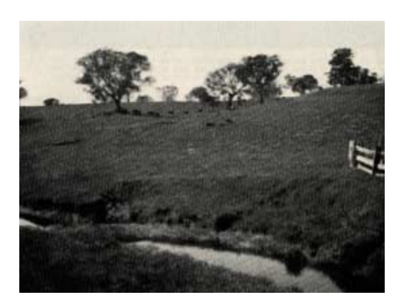
Plate 17. The Mansfield land system consists of undulating plains and low questa-form hills in Carboniferous age sediments. The main land-use is grazing. Note arrested gullyheads in the mid-left of the photo and well vegetated creek bank indicating sound land use.

Because of the lack of a rainfall peak in winter, and the fairly high evaporation in summer, the area is not a significant water source. However much of the silt which is at present reaching the drainage system originates in this area, and from the point of view of catchment efficiency it is important to prevent excessive storm runoff and the resultant gully and sheet erosion.