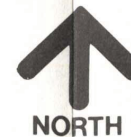
nb: Photo mosaic is strictly uncontrolled therefore inherent scale variations can be expected