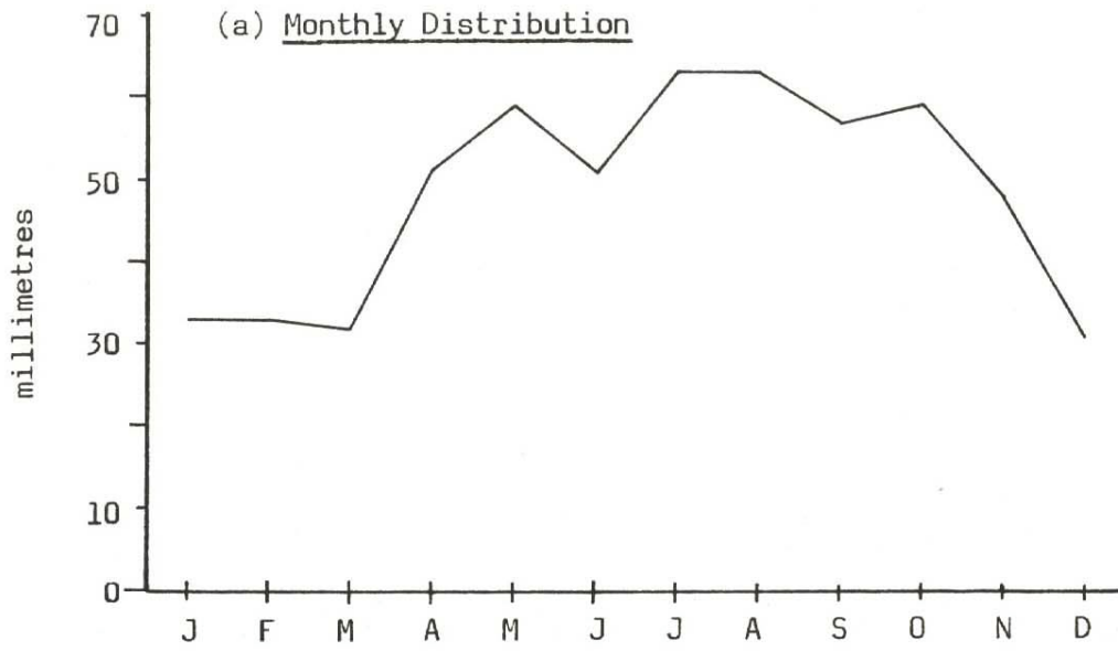
Figure W-1: Distribution of the Annual Rainfall at Westgate (Armstrong)