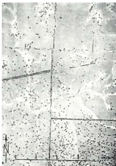
Plate 35 – Most creeks and drainage lines in Dundas land system are salted as shown in this aerial photography of part of Skeleton Creek in the parish of Mooralla.

the alienated areas of the land-system, and yet within the forests, incipient salting is occurring in the shallow zones of creek dissection.