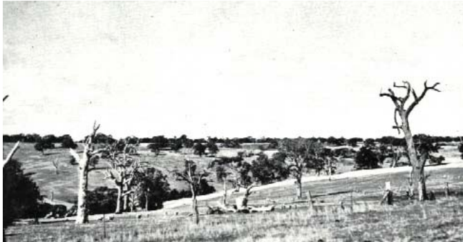
Plate 34 – Two of the land units in Dundas land system. The flat tableland along the skyline is in Cavendish land-unit, and the gentle slopes forming the zone of creek dissection are part of Stapylton land unit. The remnant of a red gum woodland covers the entire landscape

The Dundas land-system forms the eastern extremity of the Dundas Tablelands which are a clearly defined physiographic region in western Victoria between the Grampians and the South Australian border. Most of the Dundas Tablelands have been mapped and described as the Glenelg, Casterton and Dundas land-systems by Gibbons and Downes (1964) in a survey similar to the one reported here. Within their area of survey the features of the tableland are developed to the greatest degree. That is, the streams have reached their greatest degree of erosive activity so that the valleys are deep and wide and the flat tableland has been cut back to mere remnants of the original surface. The two authors mapped the tableland surface as the Dundas land-system and the valleys as the Glenelg and Casterton land-systems.