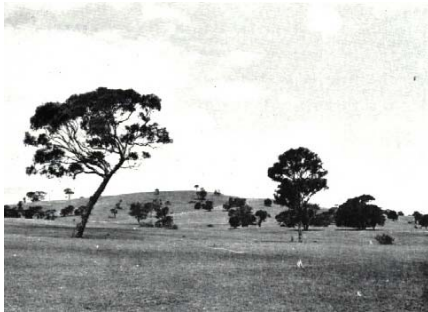
Plate 36 – Typical scene in Ararat land system, with Mt Chalambar (part of Ararat land unit) in the background and the gentler slopes of Moyston land unit in the foreground

Hills, rolling plains and undulating plains make up the landscape and the rolling plains occupy most of the mapping unit. The hills occur in the east and south-east as four parallel high ridges. The longest ridge extends for ten miles, from near Great Western at its northern end, to Mt. Chalambar south of Ararat at its southern end. Two shorter ridges occur close by to the south-west of the main one. One of these is composed of hornfels and culminates in Mt. Ararat (2,020 ft.), the highest peak in the hills. The fourth ridge is the shortest, and constitutes the lower slopes and main massif of Good Morning Hill situated near Maroona. The undulating plain is not extensive and is found along the north-western and western boundary of the land-system as a number of small, individual areas. Here the sedimentary rocks are overlain in part by coarse sands and gravels of Tertiary age.