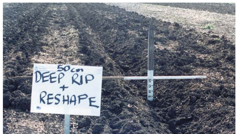
8. Beds deep ripped (2 rips per bed) to 50cm and reshaped. Bed height increased to 17.5-20cm.