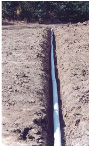
5. To relieve the drainage water from each treatment a drainage pipe has been taken across the headland to the fence line.