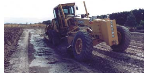
2. The roadgrader deepening the "V" drain by about 300mm reading to backfill with large crushed rock.