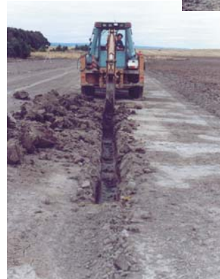
3. A backhoe digs a trench about 400mm deep ready to install the underground pipe for our second treatment. Although we used a 300mm wide bucket, probably only a 100mm wide trench would be required.