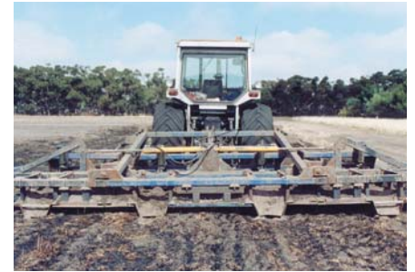
2. The back of the machine employs a shaper and soil compactor.