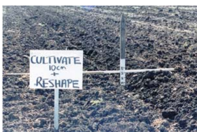
7. Beds fully cultivated to 10cm and reshaped with a standard bedding machine.