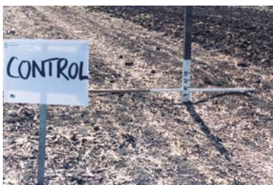
5. Two year old beds on a self-mulching clay loam at SFS, Gnarwarre. Bed height about 75mm.