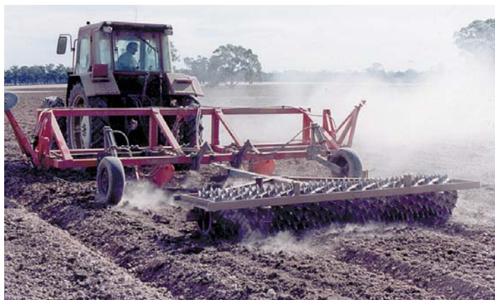
Bill Day busy making 2 beds at a time on a hot dusty day in April.

Two Victorian farmers with a mission plough straight ahead. They may be poles apart in the area they crop but Bill Day from Nagambie and Simon Gillet from Ballan have the same ideas. That is to install raised beds without full soil disturbance. Bill is going straight into pasture while Simon is going into stubble ground. How are they going? See pages 4 & 5 for the full story.