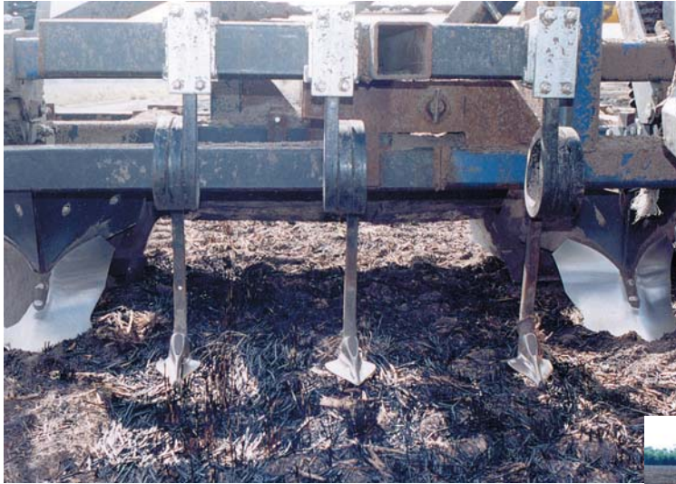
1. A recently constructed bed maintenance machine showing 3 deep cultivation tines and furrowers.

Many farmers are in the era of bed maintenance. There are lots of innovative machines and methods being employed and this page shows the efforts of a local farmer as well as a bed maintenance trial at Southern Farming Systems, Gnarwarre, which is financed by the GRDC. The results of the SFS trial will be featured next year.