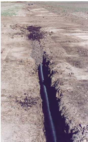
4. The 100mm slotted agricultural drainage pipe laid in the trench.