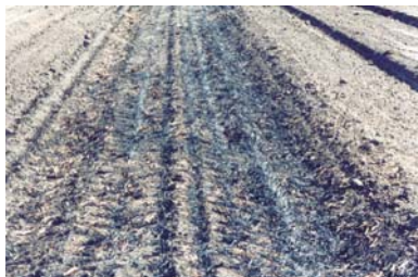
3. The starting point for the above machine. Burnt stubble on rounded beds about 12.5cm high. Soil type is a sandy loam.