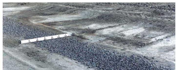
7. One of the finished underground drainage sections backfilled with 40mm clean gravel.

The information contained in this publication is offered by the Southern Farming Systems Ltd solely to provide information. While all due care has been taken in compiling the information, Southern Farming Systems Ltd and its officers and employees take no responsibility for any person relying on the information and disclaims all liability for errors or omissions in the publication.