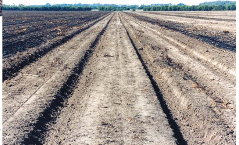
4. (Right) The machine flattens and compacts the beds. It squares off the shoulders and raises the bed to about 20cm.