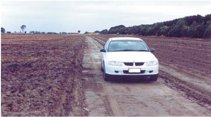
1. Using a dumpy level we determined the falls we had to play with and engaged a roadgrader to widen (25m) and heighten (800mm) the existing wide raised bed headland. With the roadgrader we placed a slope on the apron between the ends of the beds and the main drain. For our purposes, the main drain is "V" shaped and not flat as normally recommended.

By their very nature, raised bed paddocks are a complex of raised soil areas set between surface drains. These surface drains of course are the first areas to get wet and the last to dry out. In particular, trafficking through headland drains has proven very difficult in some paddocks which have little slope. Southern Farming Systems, with funding from the GRDC have a headland management project established on our concept farm at Winchelsea. The following photos summarise part of our attempt to better manage our headlands. The headland chosen is relatively flat but very low-lying and it has proven difficult to move water out of the paddock previously. As we all know, the main collector drains need to be open to move water quickly but safely from the paddock. To remove the remaining puddles and other surface water we have modified the main drain with three treatments. The first is using large (40mm - 200mm) crushed rock to act as an underground drain and provide a firm surface for the tractor. The second is an underground drain (100mm slotted plastic pipe) backfilled with 40mm clean gravel. The final treatment is a control. These three treatments are replicated twice down the headland.