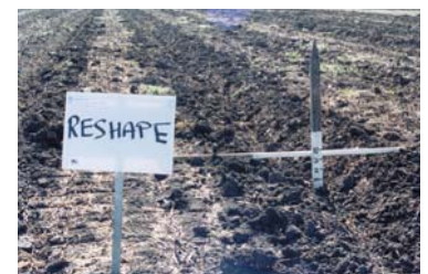
6. Beds reshaped with a standard bedding machine. Bed height increased to 17.5cm.