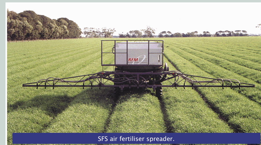
SFS air fertiliser spreader.

'Everyone benefits from best practice whereas poor management can potentially give the industry a bad name'.