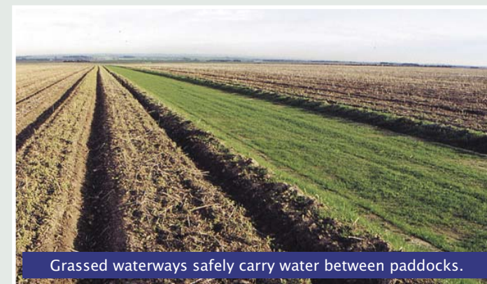
Grassed waterways safely carry water between paddocks.

Headland and collector drain management: Carefully designed headlands and collector drains are key elements in raised bed cropping. Well designed systems reduce potential erosion and increase traffic access in wet periods. Headlands need to incorporate collector drains at the end of the beds to capture runoff from the furrows and direct water to the permanent grassed waterways. Main collector drains need to be flat, wide (about 2m), on a gentle slope (ideally <1 %) and fully