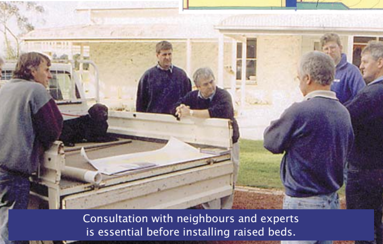
Consultation with neighbours and experts is essential before installing raised beds.