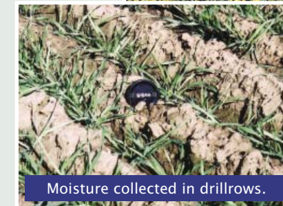
Moisture collected in drillrows.

Drill row grooves on top of beds: When sowing, the use of press wheels for improved control of sowing depth ensures the development of grooves in the drill rows. These grooves are useful in harvesting moisture and reducing runoff in dry periods, particularly in hardsetting surface and hydrophobic soils.