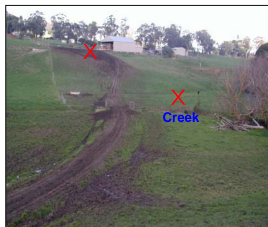
Figure 11. Research farm before willow removal. X indicates nutrient accumulation areas.

An uneven distribution of nutrients occurs on these farms, as indicated by high soil Colwell K (indicator of dung and urine deposition), soil Olsen P, and the ground-water total K measured on the upstream dairy farm. The nutrient accumulation areas measured are most likely due to nutrient deposition by cows. On the upstream dairy farm, this deposition occurred where cows congregated in the stand-off area near to the dairy shed before and after morning and night milking. Nutrients have also accumulated in riparian areas near to the creek on this farm and this is most likely due to movement from the stand-off area and dairy shed downslope, rather than from the effluent ponds, or as a result of stock or fertiliser management in this area (Figure 11).