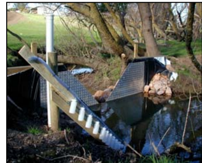
Water quality measuring point at a weir prior to willow removal.

Ecological data: small mammals, birds, vegetation and canopy cover.