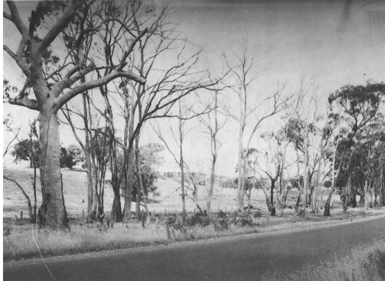
Plate 1. Trees killed by saline seepage at the foot of a hill