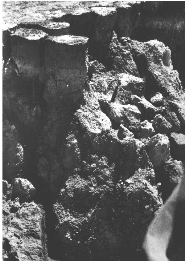
Plate 6. Gully head operating by blockfall