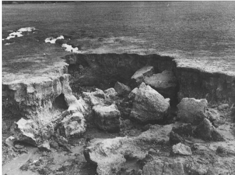
Plate 4. Undercutting of a head by diversion of the waterfall