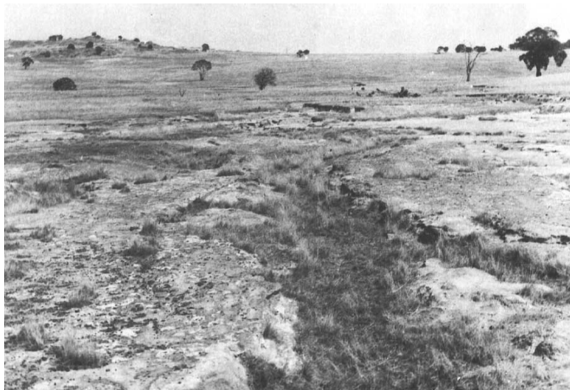
Plate 2. Scour gullies developed from rills on a salt pan