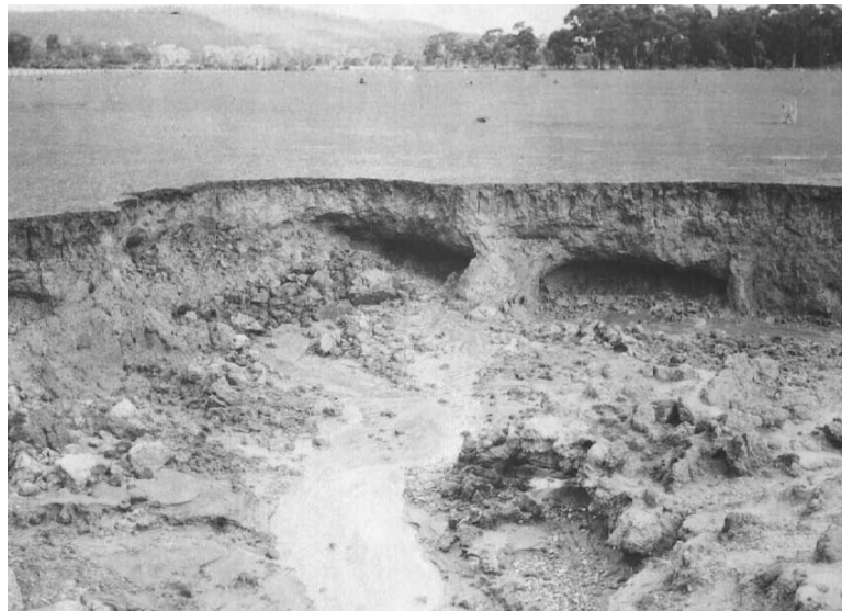
Plate 8. Basal extrusion sapping. Erosion is proceeding without surface runoff