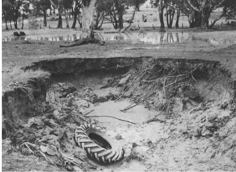
Plate 7. Undermining of a hea by waterline earthflows after a flood