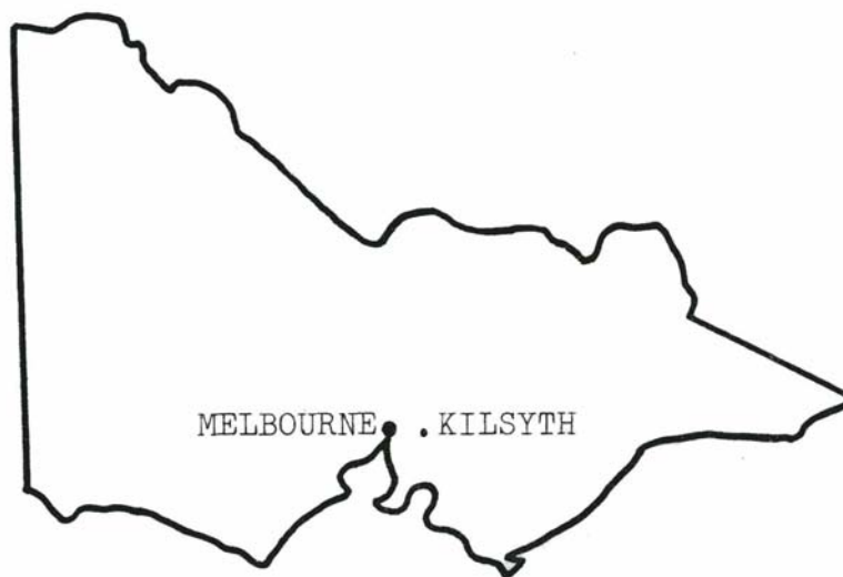
Figure 1.2 – Scale 1:7,500,000 – Location of Kilsyth Study Area