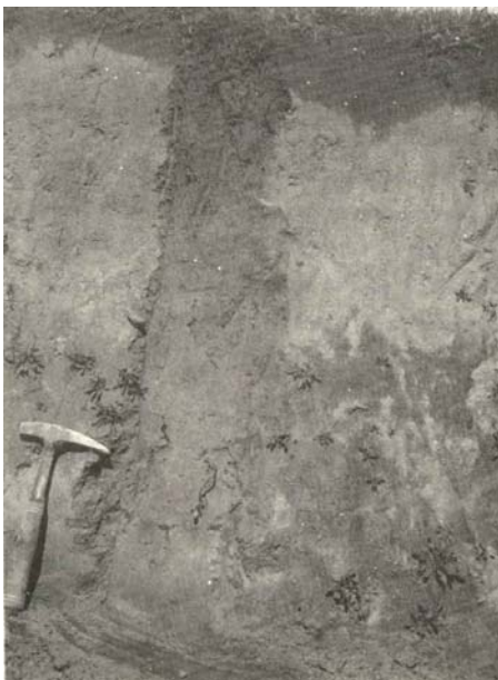
Plate 3 – A typical soil that occurs on recent river deposits. It has a deep brown sandy profile, weakly developed and generally acid (pH 5) throughout.