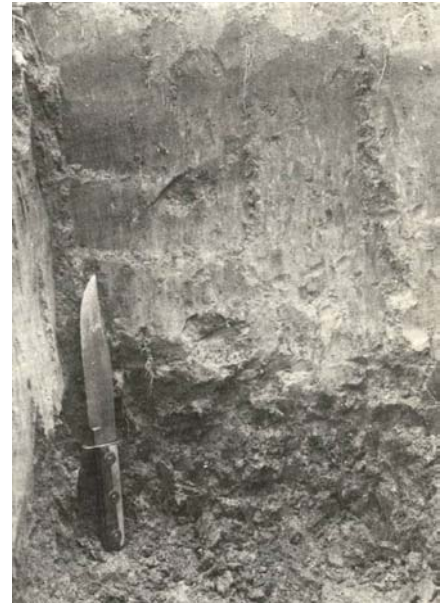
Plate 2 – Typical profile occurring on Silurian parent material as well as on some river deposits. The soil is neutral (pH 6.5) with light textured overlying apedal, A 1 and A 2 , horizons abruptly to a heavy textured mottled yellow B horizon with strong blocky structure.