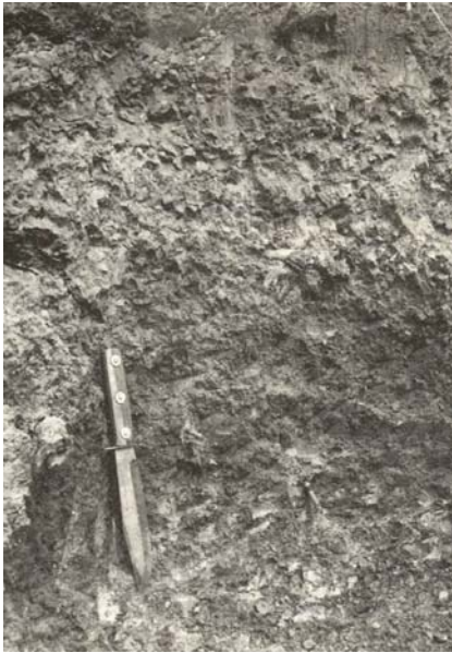
Plate 1 – Typical soil profile from component 1. Profile is acid (pH 5), and stony throughout A 1 , A 2 , B 1 , B 2 and C horizons present. Moderate structure is evident.