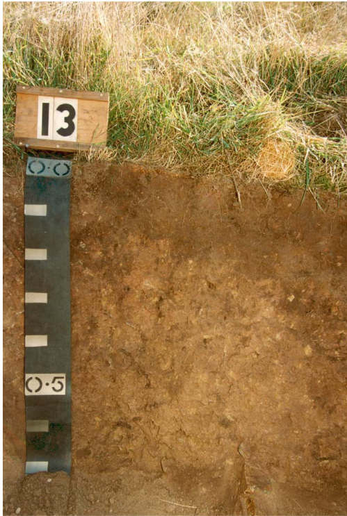
Plate 5 Uniform clay loam (Um6.14)