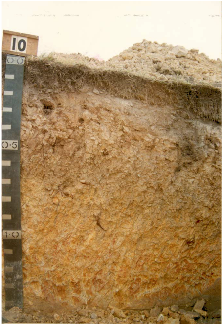
Plate 1 Yellow duplex soil (Dy3.11)