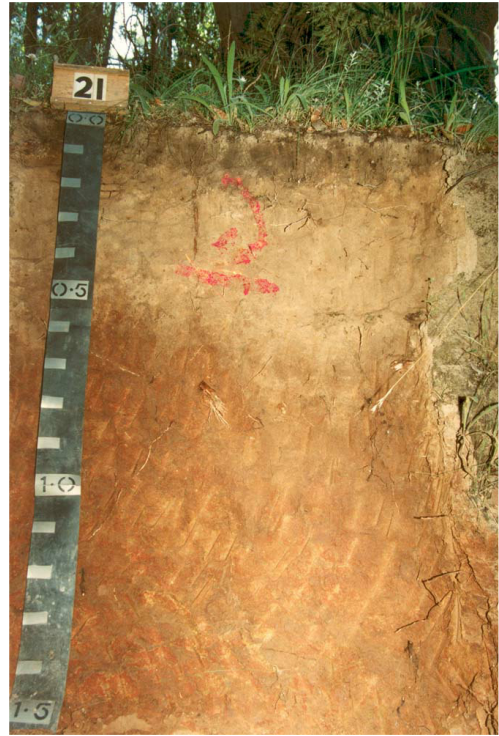
Plate 6 Red duplex soil (Dr3.22)