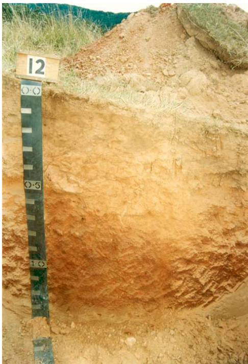
Plate 19 Yellowish red gradational soil (Gn3.51)