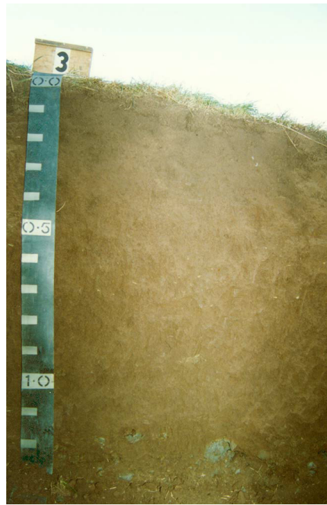
Plate 16 Dark gradational soil (Gn4.42)