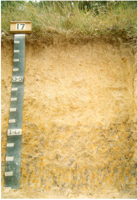
Plate 9 Yellow duplex soil (Dy3.11)