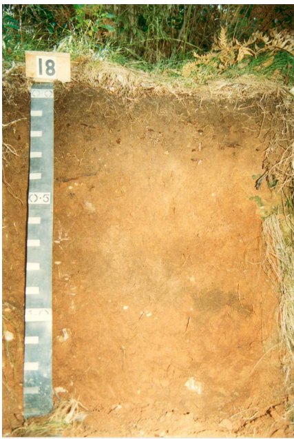
Plate 11 Dark reddish brown gradational soil (Gn3.11)