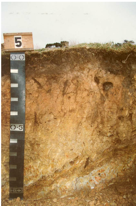
Plate 3 Yellow duplex soil (Dy3.41)