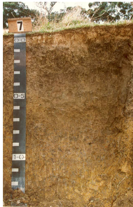
Plate 4 Uniform silty clay (Uf4.3)