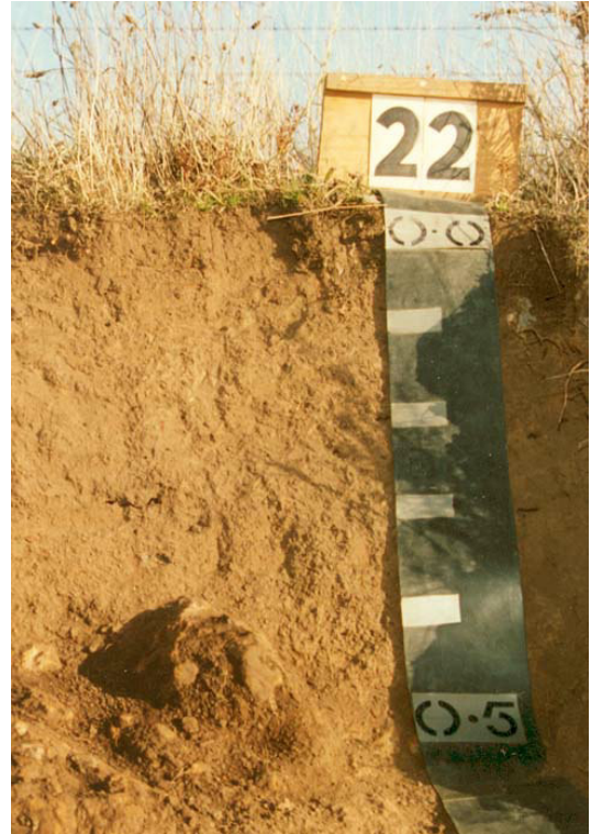
Plate 18 Uniform silty loam (Um1.44)