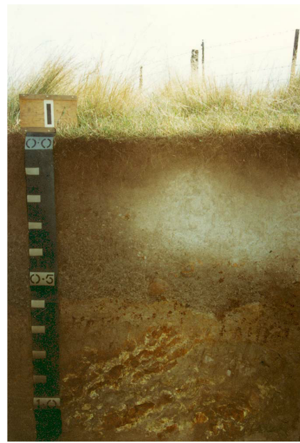
Plate 12 Yellow duplex soil (Dy2.3)