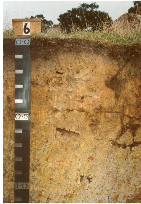
Plate 2 Yellow duplex soil (Dy3.21)