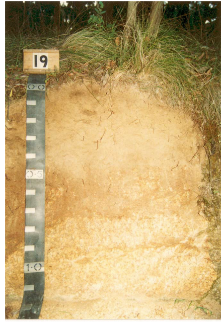
Plate 10 Yellowish brown gradational soil (Gn4.51)