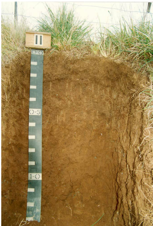
Plate 15 Brown duplex soil (Db1.12)