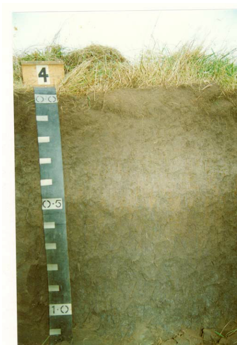
Plate 20 Dark duplex soil (Dd2.21)