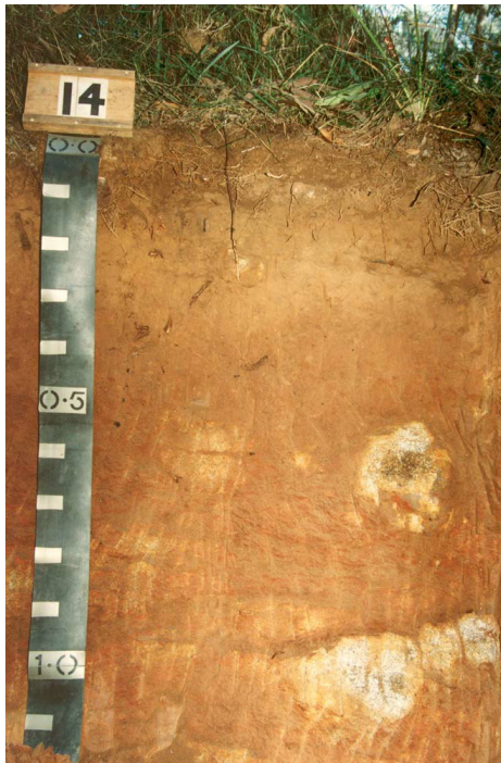
Plate 7 Red duplex soil (Dr3.42)