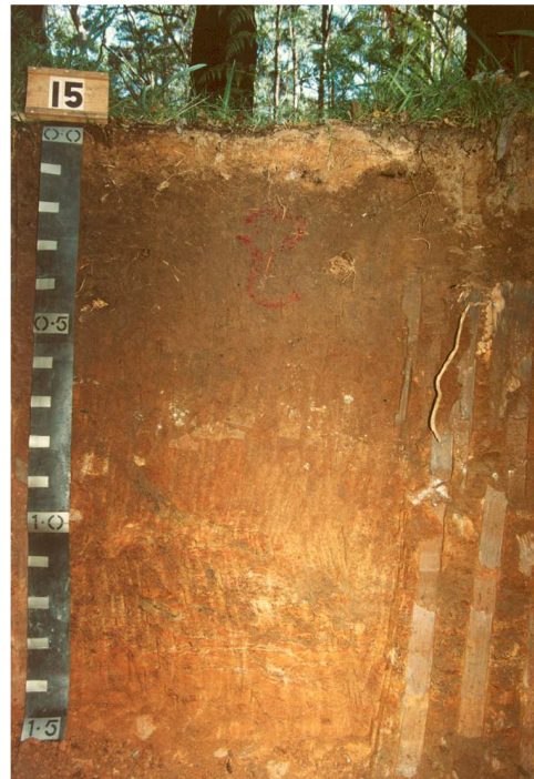
Plate 8 Brown duplex soil (Db2.11)