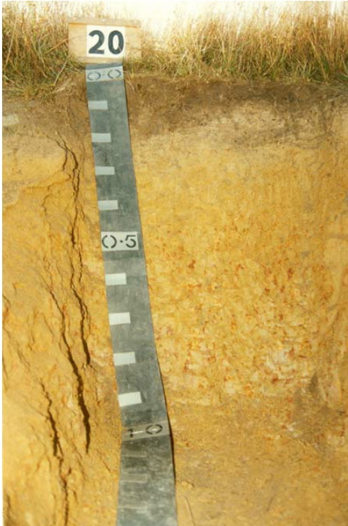
Plate 21 Yellow duplex soil (Dy3.41)