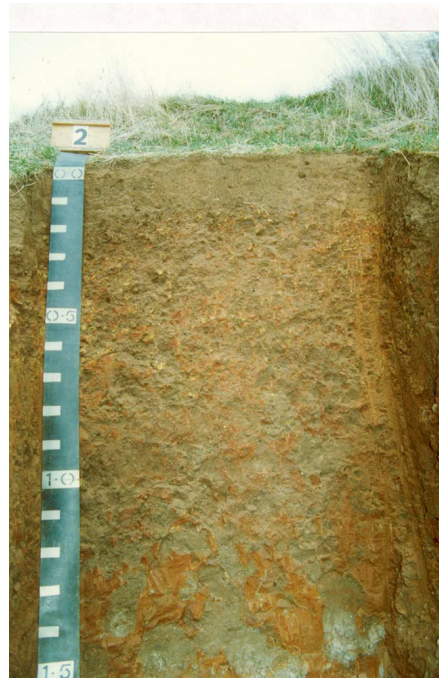
Plate 14 Brown duplex soil (Db1.12)