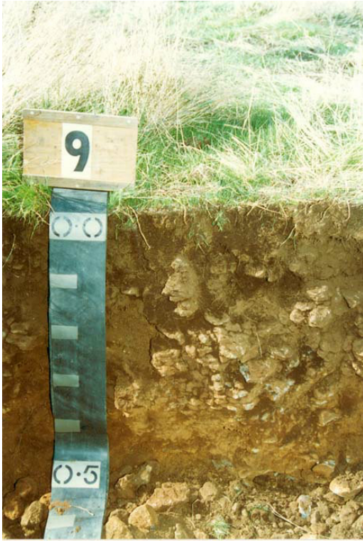
Plate 17 Uniform silty loam (Um1.14)