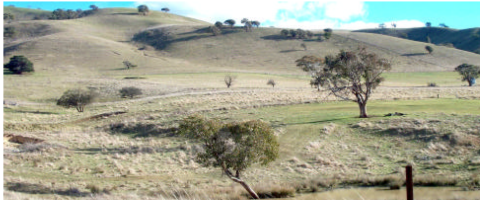
Position in landscape