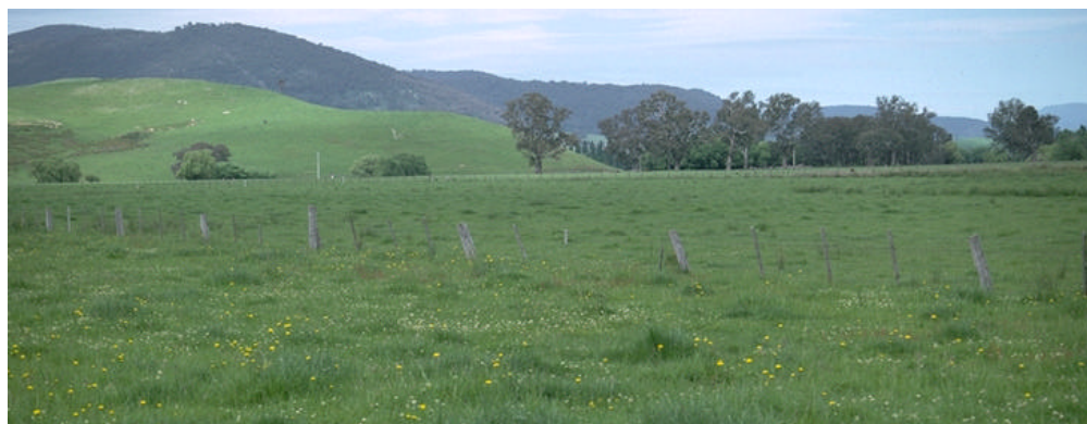
Position in landscape