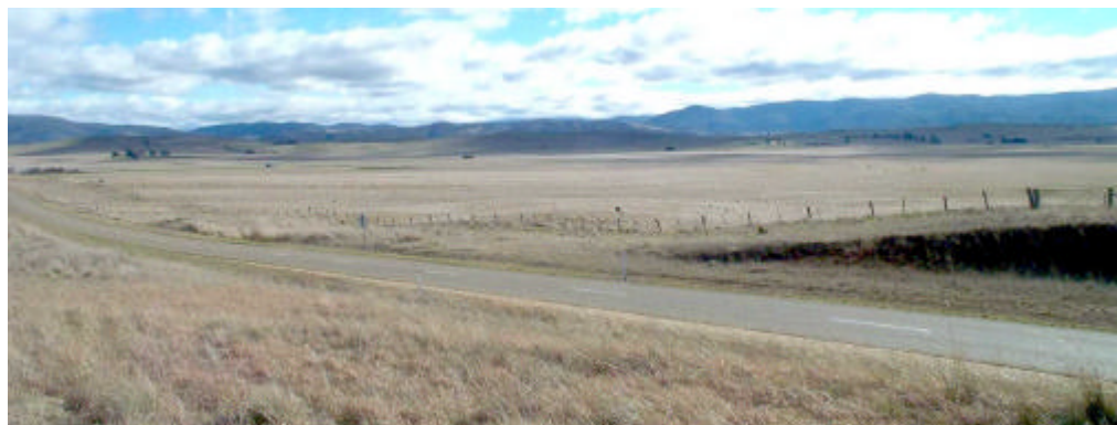
Position in landscape