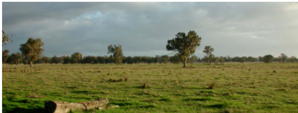
Position in landscape