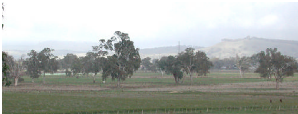
Position in landscape