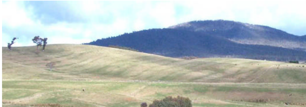
Position in landscape