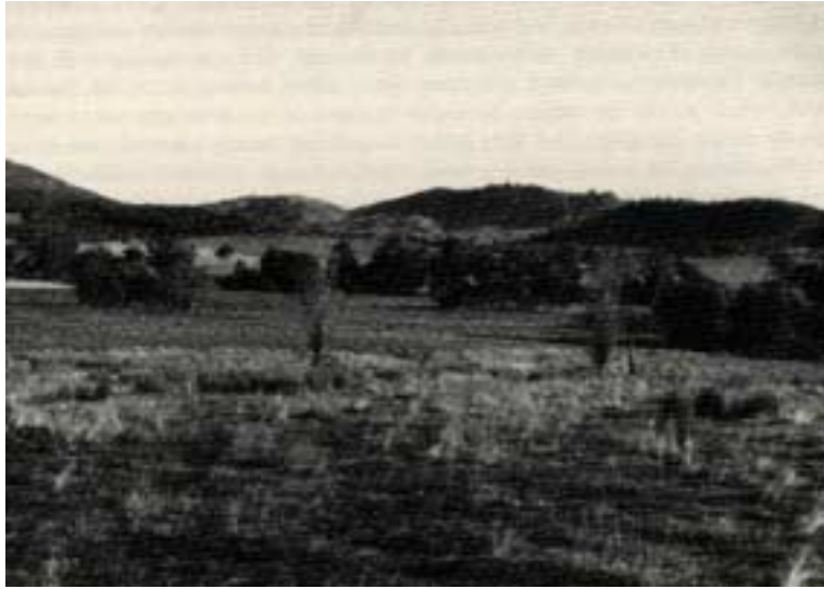
Plate 15. Low hills and valley slopes make up the Swanpool land system. The area shown is at Lima South.

The steep slopes have a high erosion hazard, and poor land use could result in significant erosion and sedimentation of the lower slopes. The present condition is generally sound.