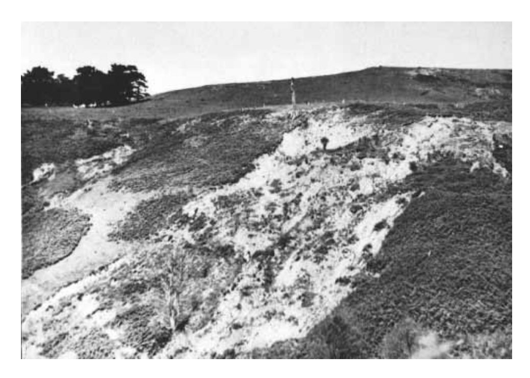
29. Landslide in loams overlying Jurassic sedimentaries near Allambee - South Gippsland

The illustrations below show the desirability of more attention being devoted to land use.