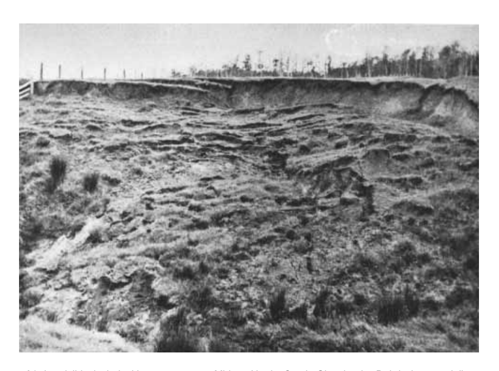
31. Landslide in balsaltic country near Mirboo North, South Gippsland. Debris has partially blocked creek, and is washing away.