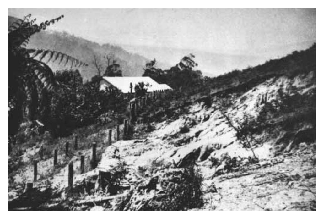
30. Landslide in the light arenaccous loams overlying the granite in the Cannibal Creek area (Bunyip Catchment). Under prevailing climatic conditions, this soil is too unstable to remain on these slopes without the protection of the forest.