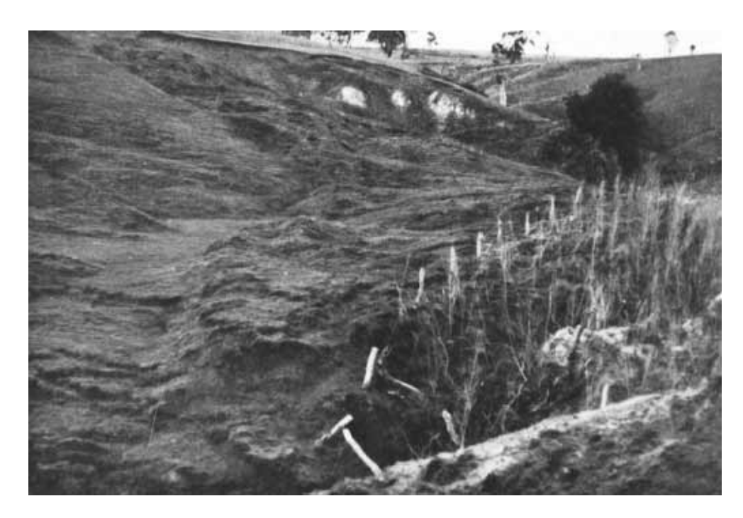
32. Landslides - Coleraine. Willows planted to bind the soil.