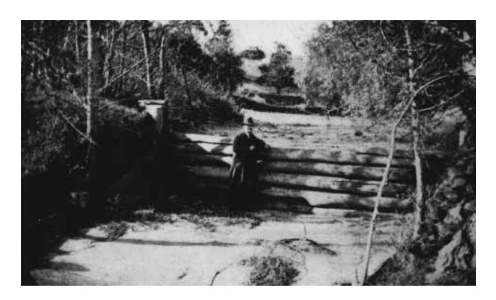
65. Check dam to stop scour alongside Gisborne road, Bacchus Marsh Shire