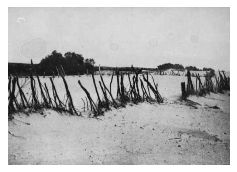
61. North of Hopetoun. Brush fence to check sand drift which was blocking channel.

In the last analysis, a strong growth of vegetation is the best protection against erosion, whether by wind or water. The purpose of groynes, checkdams and other engineering structures to check water erosion is to reduce the speed of the water flowing past the eroding section to a non-scouring velocity, until such time as a strong vegetative cover can be grown to take over the job of protection. Brush fences, &c., serve a similar purpose for wind erosion.