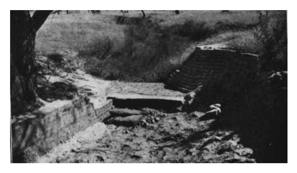
70. Near Benalla. Brick and concrete drop constructed by land holder in scouring gully. This has been effective in preventing extension of scour.