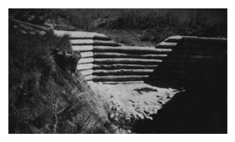
64. Log dam across scour near Bindi Station. This is now filled to the top