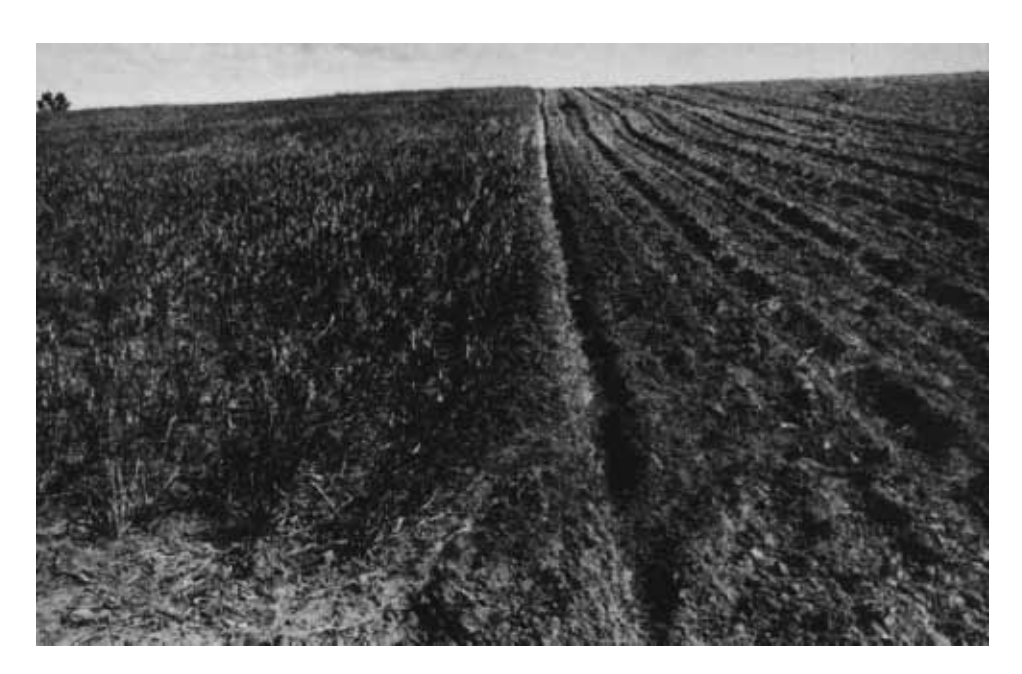
63. Mallee Research Station, Walpeup. Part of drift control equipments - on left - oats acting as cover crop - to be grazed. On right - furrowed fallow.