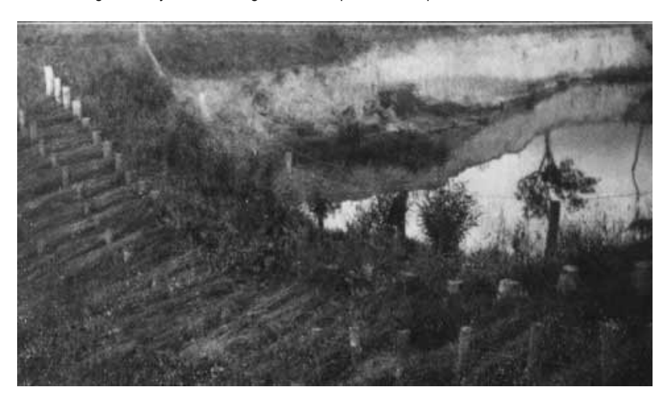
68. Brush dam to catch silt derived from eroding banks, Skull Creek, near Bairnsdale.