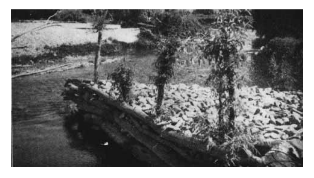
72. Up stream view of groyne installed by land holders on the Upper Tambo River.