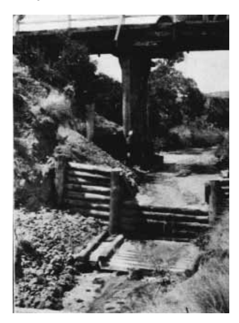
66. Small log dam constructed by Omeo Shire to protect road bridge over scouring gully.