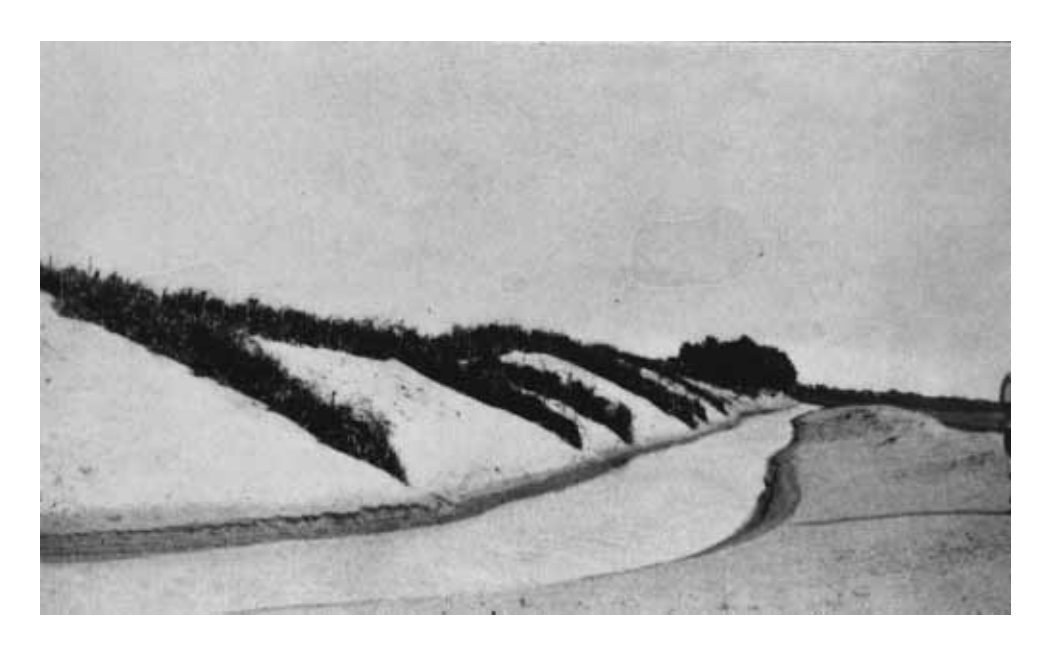
62. Brush wind check at side of channel. Block 28, Mittyack