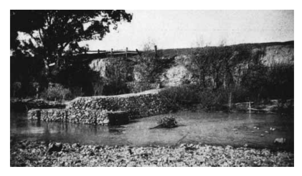
74. Lerderderg River, Bacchus Marsh. Protection of eroding bank. Shingle and wire type groyne, showing siltation to original end of groyne in two years, and recent extension. Note willow stakes in silt bench.