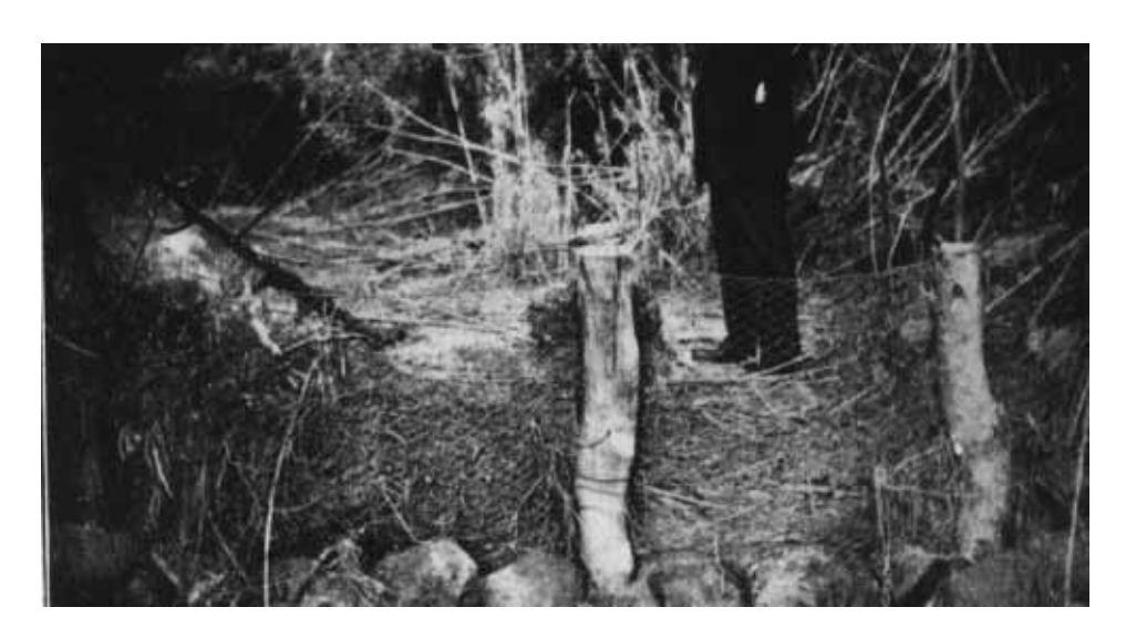
71. Showing how even ordinary wire netting will catch silt. Note how leaves, &c., have lodges against the netting, forming a silt trap.