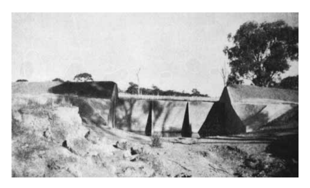
67. Concrete drop on the Sheep Pen Creek, at Caniambo. This is to check the extension of a branching scour, by concentrating all flow at a protected drop.