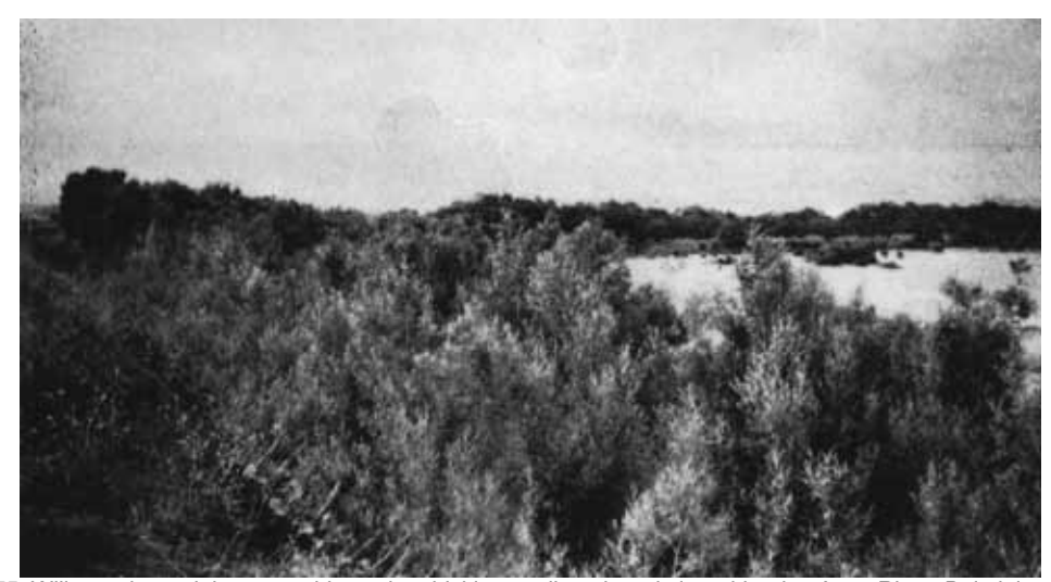
75. Willows about eight years old growing thickly on cribwork and sloped banks, Avon River, Boisdale. Shingle banks in river bed at back.