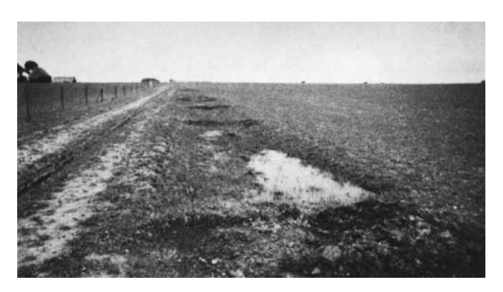
69. Small check dams of grass and manure constructed by land holder to check scour alongside road formation.