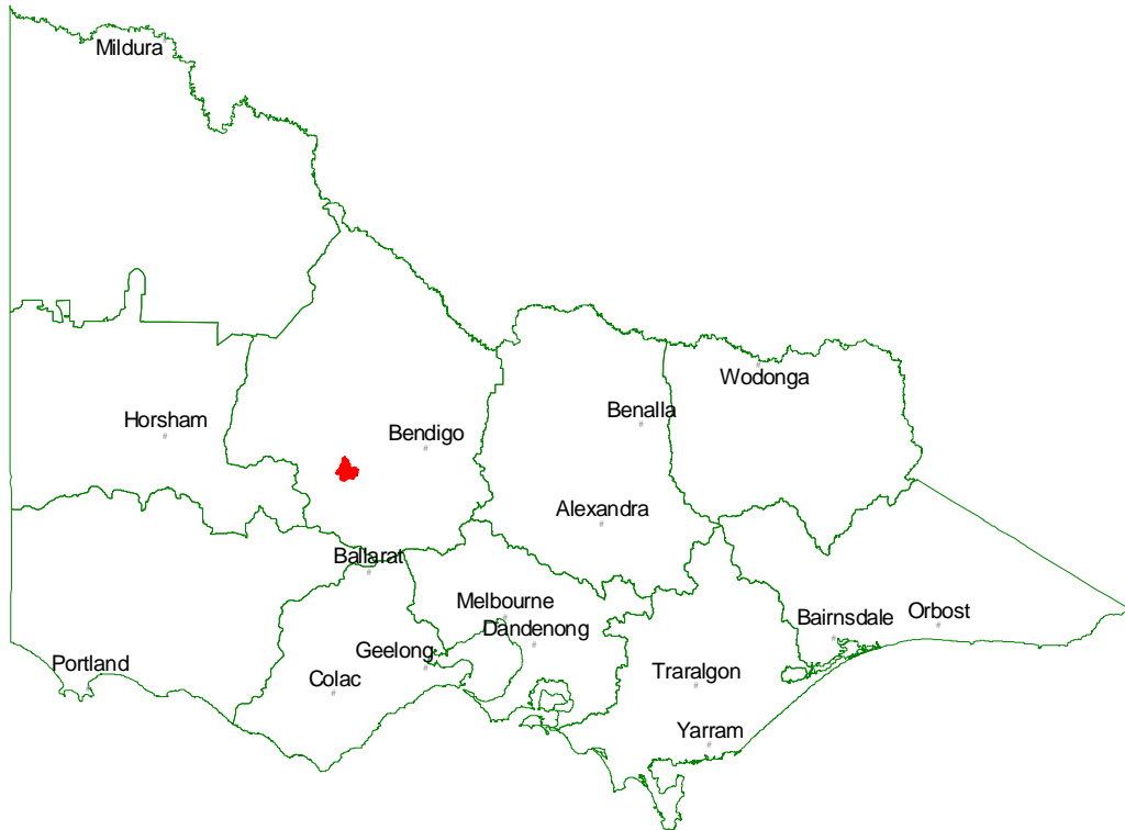
Figure 1 Location map of Timor West targeted area