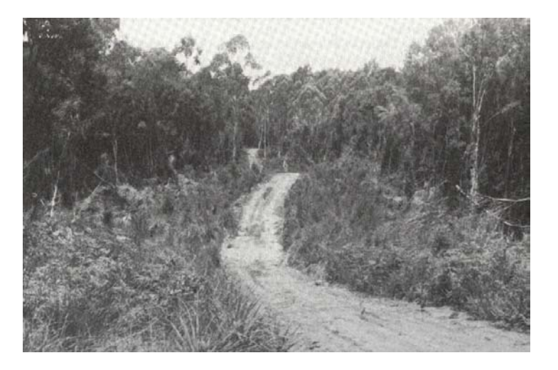
The higher parts of the landscape form undulating hills, with E. regnans successfully competing with other trees on sand soils.

Only minor parts of this land system have been cleared and it appears that a marked decline in soil fertility has resulted. Hardwood forestry is the main land use, together with a small industry in the cutting of tea-tree stakes.