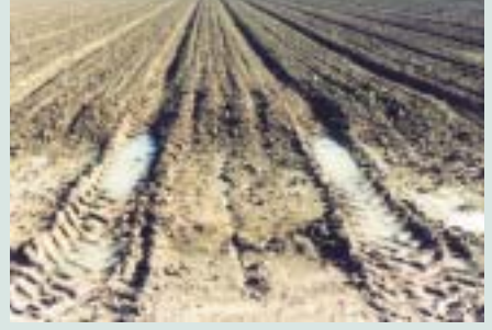
At sowing time conditions were moist and the collector drains on the control treatment instantly showed the effects of tractor and airseeder weight.