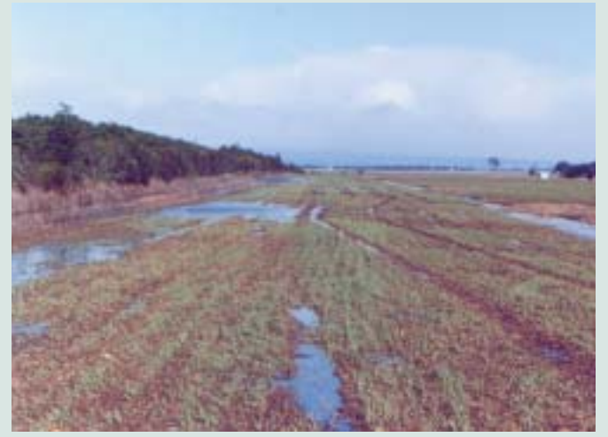
Flat, poorly drained headland