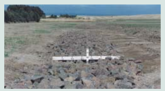
One of the finished large crushed rock treatments.

These three treatments were replicated twice down the headland. Water from each treatment was removed by an underground drain across the headland.