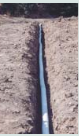
To relieve the drainage water from each treatment, a drainage pipe was taken across the headland to the fence line.