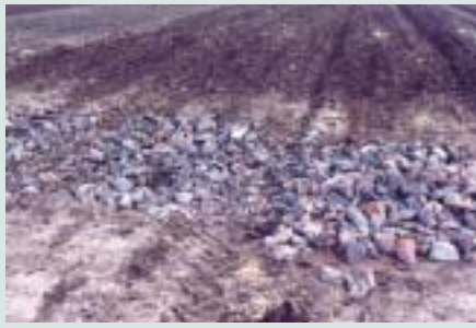
The large crushed rock treatment took the weight of the machine but the rocks squashed into the mud. The tractor driver said he needed to slow down to cross the collector drains. He was also worried about potential damage to the tractor tyres.