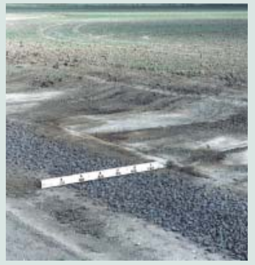
One of the finished underground drainage sections backfilled with 40mm clean gravel.