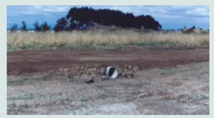
Culverts at lowest point in paddock

With the road grader, a slope of 1% (same slope as paddock) was placed on the apron between the end of the beds and the collector drain. To help water easily find the lowest point the collector drain was 'V' shaped and not flat, as normally recommended. Flat drains are normally used to reduce the likelihood of soil erosion. However, flat drains normally accumulate puddles.