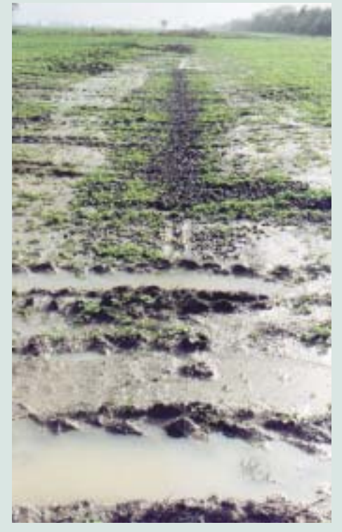
During the winter it became very apparent that the underground drainage treatment was far superior. This photo shows the control (foreground) compared to the underground treatment (background).