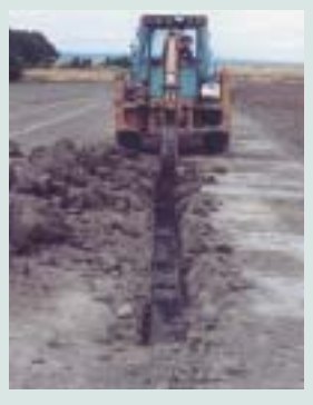
A backhoe digs a trench about 400mm deep ready to install the underground pipe for our second treatment. Although we used a 300mm wide bucket, probably only a 100mm wide trench would be required.