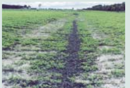
The underground treatment in late winter. Note the slightly wet areas between the gravel and the beds in the foreground. This apron had a slope of approximately 1%.