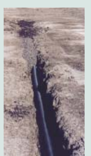
The 100mm slotted agricultural drainage pipe laid in the trench.