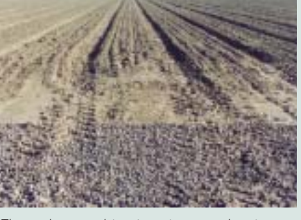
The underground treatment removed water very well and remained dry and withstood the tractor weight very easily.