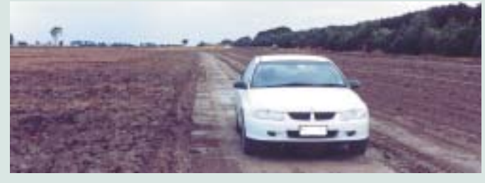
Using a dumpy level we determined the falls we had to play with and engaged a road grader to widen (25m) and heighten (650mm) the existing wide raised bed headland. With the road grader we placed a slope (1%) on the apron between the ends of the beds and the main drain. For our purposes, the main drain is "V" shaped and not flat as normally recommended.