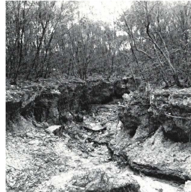
Forage-harvesting the eucalyptus leaf also removes ground litter, leaving the soil surface bare and unprotected. This decreases infiltration of water and increases run-off. High run-off can cause severe gully erosion even when the drainage floors are densely vegetated.