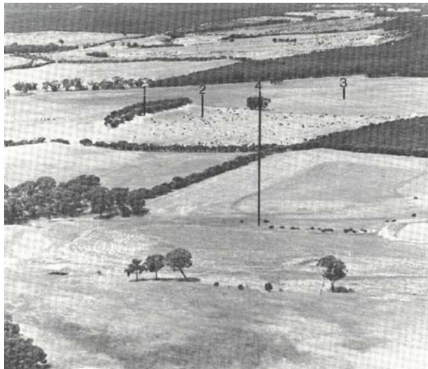
Large areas of mallee scrub have been cleared for grazing.

The land system is particularly sensitive to disturbance, and sheet erosion is widespread. Reclamation is hampered by the harsh climate and difficult soil conditions. The drainage lines are prone to gully erosion and salting and are usually left under natural vegetation for stabilisation, but sheet erosion is by far the most common form of deterioration.