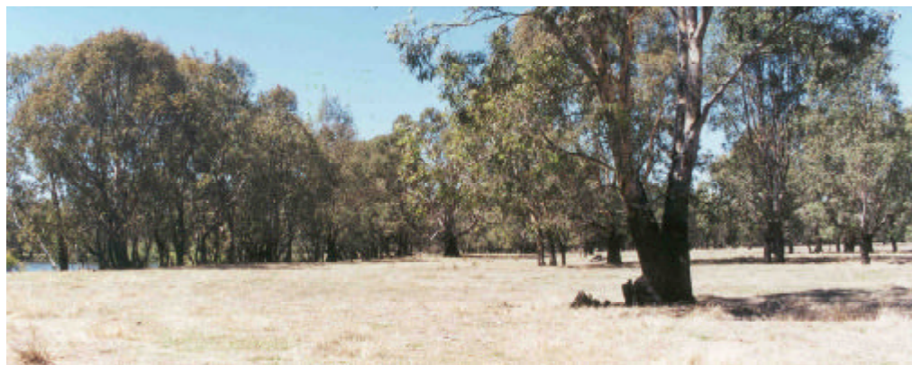
Position in landscape